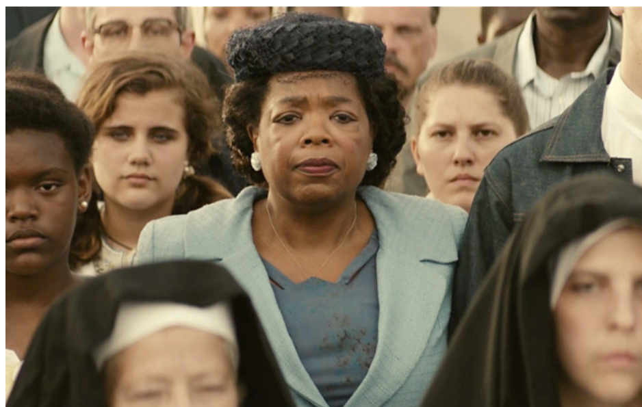
Civil rights activist Annie Lee Cooper as depicted by Oprah Winfrey in the movie Selma (Paramount Pictures, 2014). Read about Cooper at onevotesncc.org/profile/annie-lee-cooper .

In addition to the many obvious difficulties present in the literacy test, there are several pitfalls that citizens taking the test could have fallen victim to. For example, question 20 asks for a “statement setting forth your understanding of the duties and obligations of citizenship.” Do students realize that this question can have—for citizens in a democracy—a unique answer for each citizen? Teachers can highlight this fact with students through a class activity in which several students share their answers to question 20 verbally or by writing on cards. Then the class as a whole can track the similarities and differences between everyone’s answers. The teacher could point out ways that the unique answers that citizens given for question 20 (and other questions) provide “wiggle room” for county registrars to target and blithely fail African Americans, thereby denying them the right to vote. This helps students to better understand how voter suppression during the Jim Crow era worked.