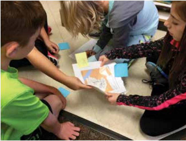
Image 1. A small group of students selecting priority questions and writing them on sticky notes

Kim led a class discussion about the differences between question types. During the discussion, Kim pushed the students to consider the pros and cons of both question types, and she recorded the students' ideas on chart paper. To further support students, teachers might follow up this discussion by providing students with the Question Types handout (Handout 3). Teachers can facilitate a discussion about the information on the handout and ask the students to complete the Question Types Sort (Handout 4) as a formative assessment.