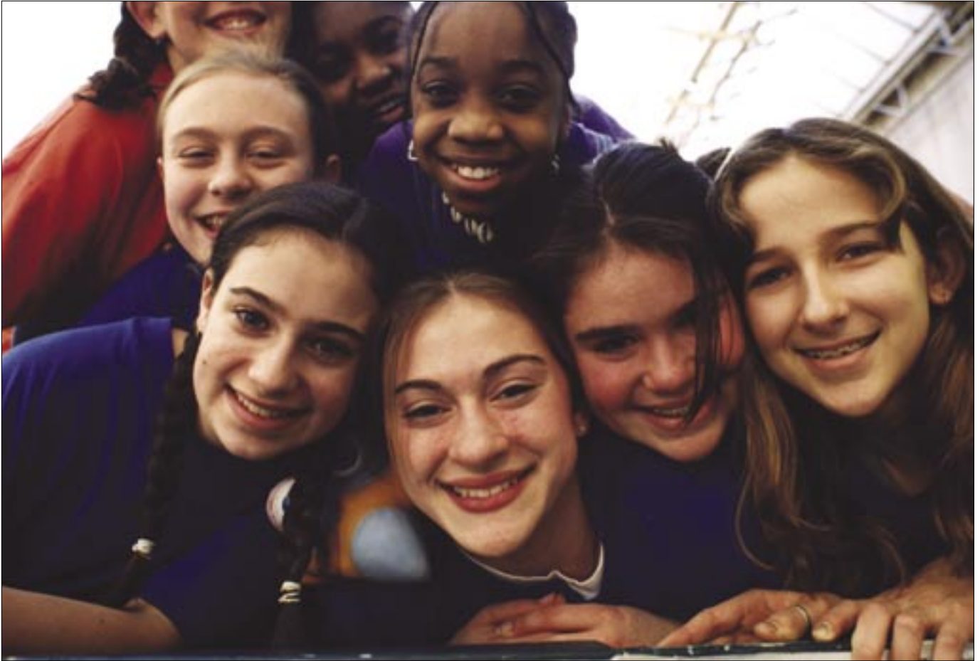
Corporation for National and Community Service