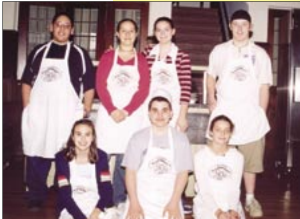
Break time at Saturday's Bread, a soup kitchen in Oneonta, New York.

CROP is the name given to community, interfaith hunger education and fundraising events sponsored by Church World Service and organized by twenty-two CWS/CROP regional offices across the United States. (In some CWS/CROP regions, CROP has come to mean "Communities Reaching Out to People.") Some 2,000 fundraising events occur each year. Their free online educational materials include a handout, "Build a Better World;" a study/action guide, "Facts Have Faces;" a handbook on activities, "We Can Do That Too!;" and a simulation game, "Hungry Decisions." Call 888-CWS-CROP or visit www.cropwalk.org .